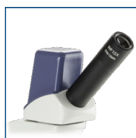
Digital monocular head