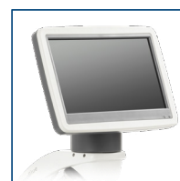
Digital LCD head